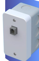
FC3J Fan Control installed in the junction box on the fan.

Your whole house fan installation includes an RT3 Wireless Remote Control, an RM3 Radio Module, a 7' Plug&Play Cable and an FC3J Fan Control installed in the junction box on the fan.