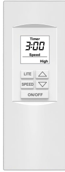
RTMR Remote Control